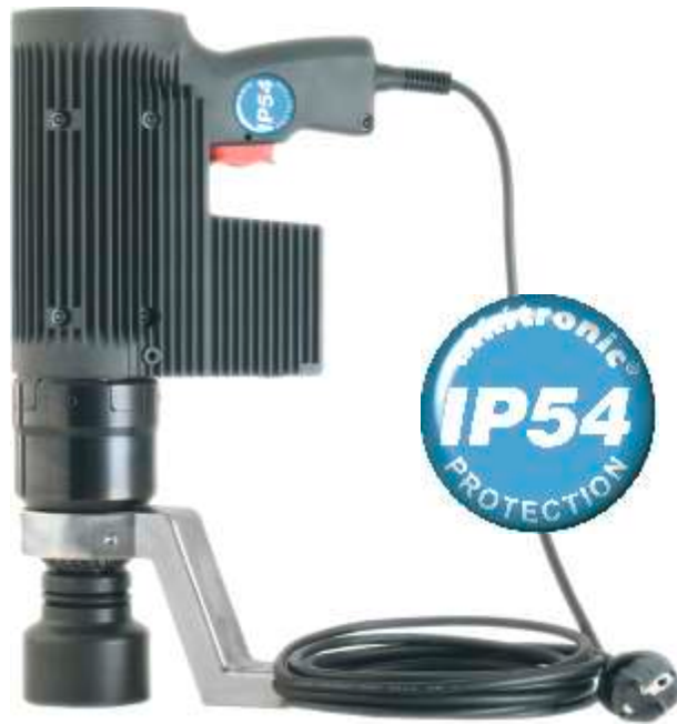
EFCip 100 / EFCip 100plus